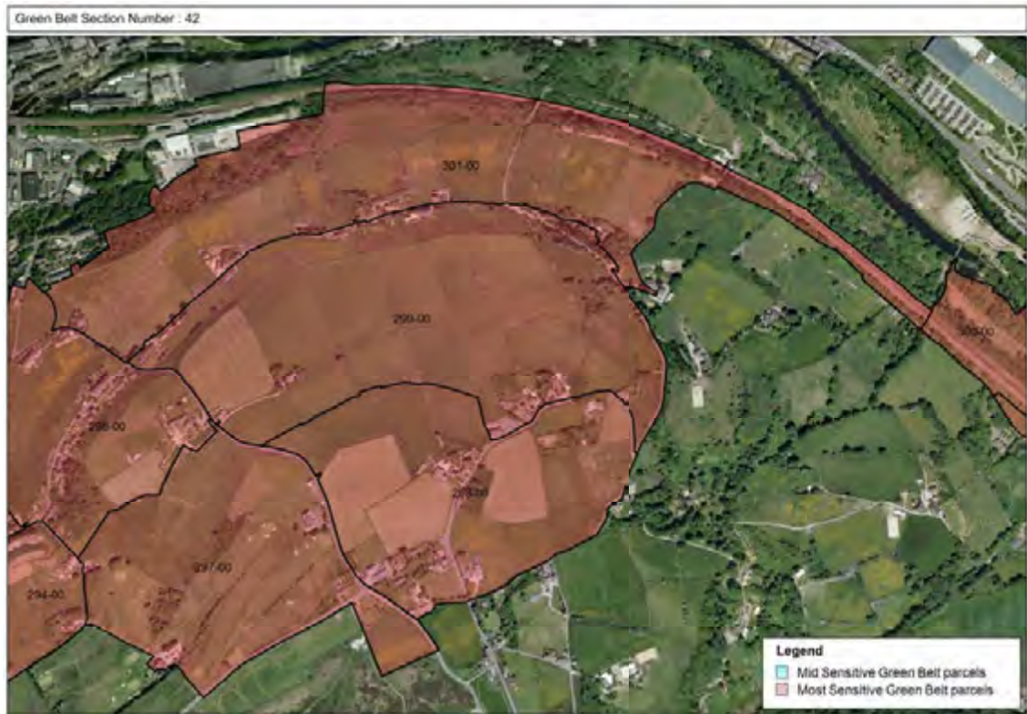
Table 48 Section 42 Results