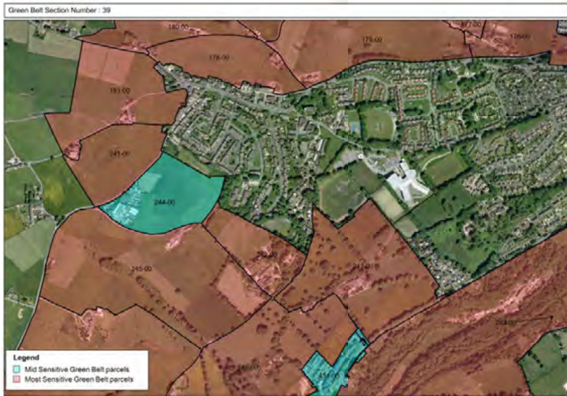
Table 45 Section 39 Results