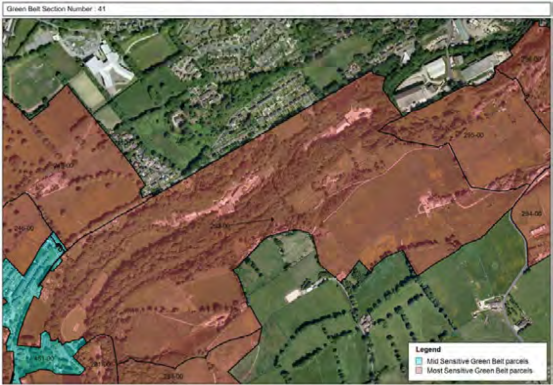
Table 47 Section 41 Results