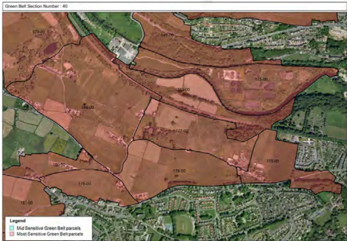
Table 46 Section 40 Results