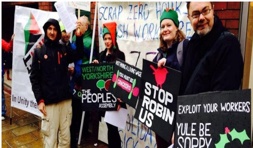
Demonstration against austerity - February, Leeds 2015.

During the previous twelve months various organisations across the county of West Yorkshire have been subjected to industrial action. This has had the most impact on public bodies such as Local Authorities, Fire Service and Ambulance Service. Due to key partners coming together and developing contingency plans the impact has been significantly reduced on our communities.